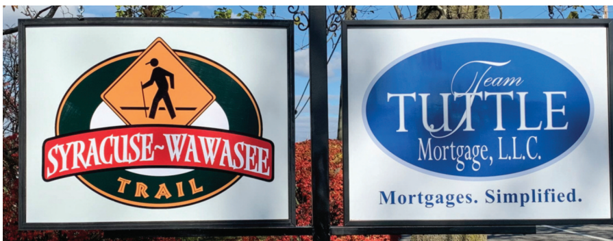
Our New Office Sign