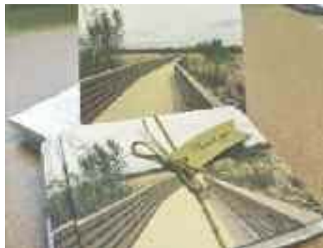
Notecards for sale! $25 if you pickup or $35 if we ship.