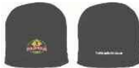
Winter is here — hats for sale $10 if you pickup or $20 if we ship.